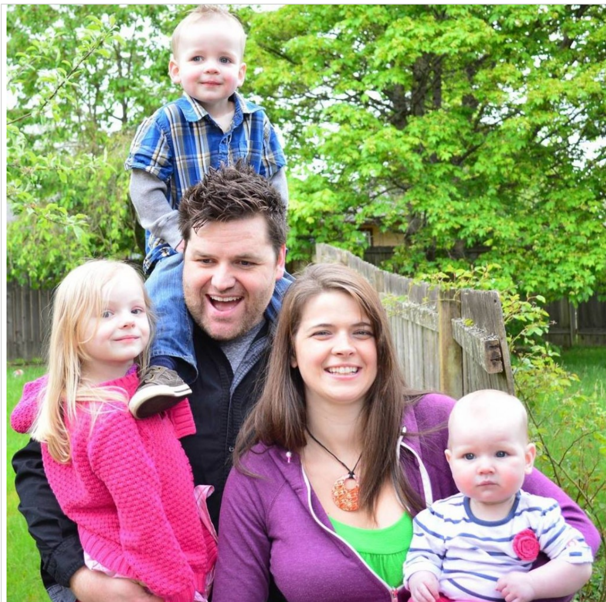
Family is Why We Must Fight for America

America is about families, never forget that!