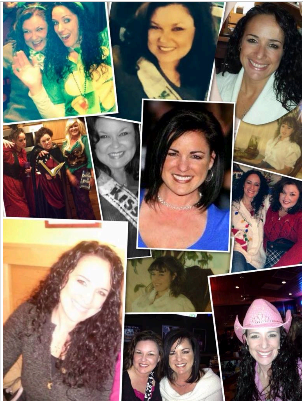
Family is Why We Must Fight for America