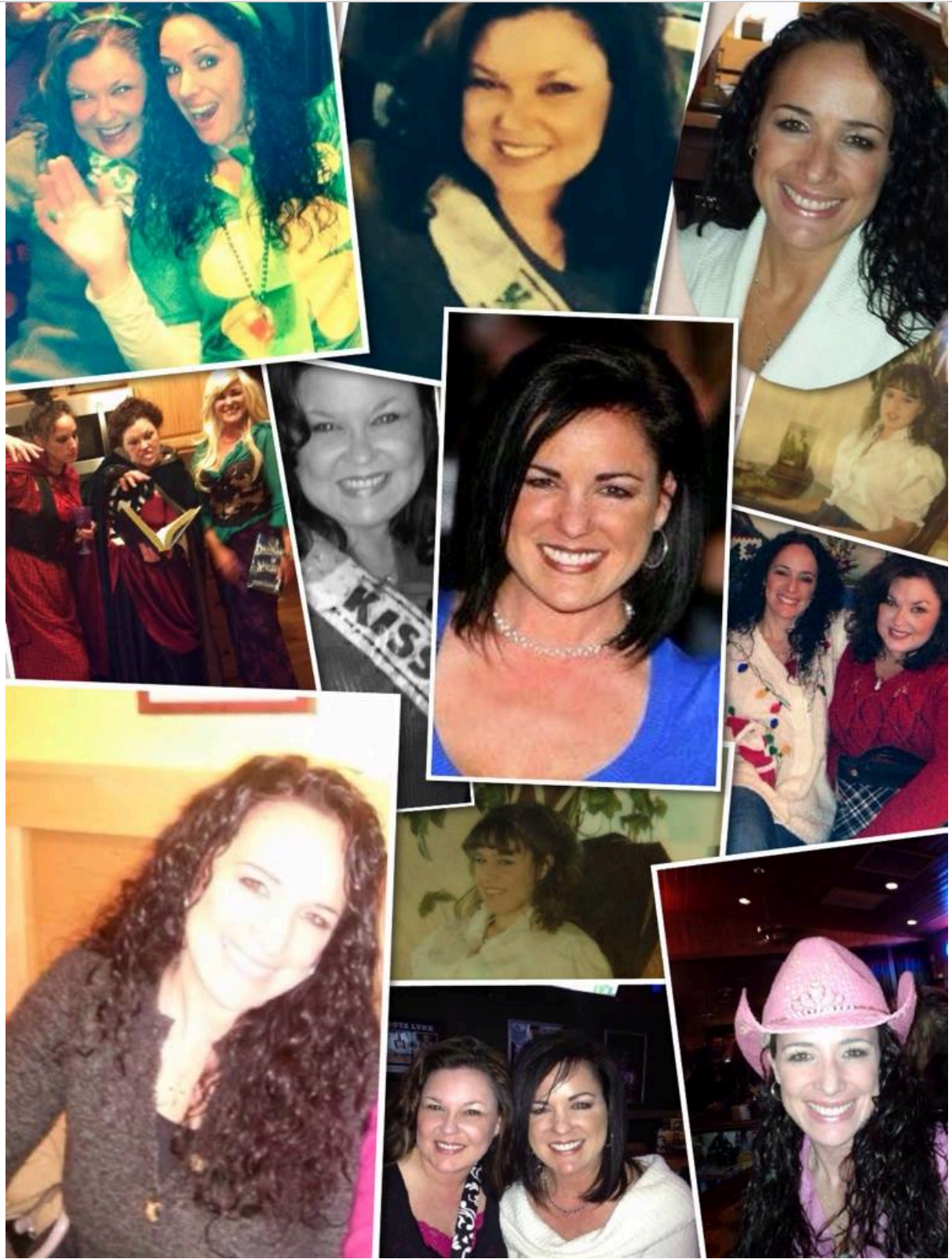
Family is Why We Must Fight for America